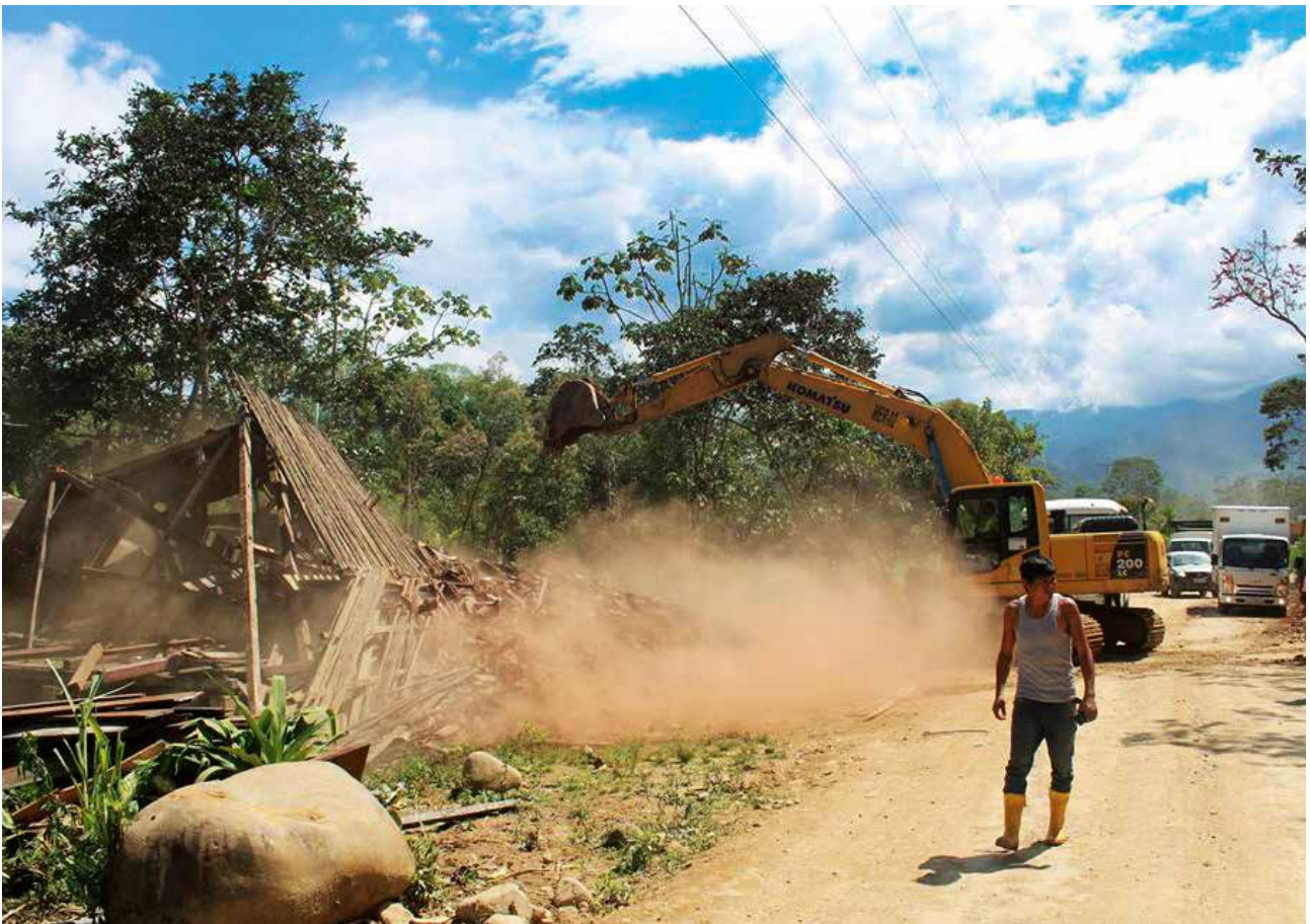
▲ CASCOMI - La Comunidad Amazónica de Acción Social, Cordillera del Cóndor Mirador, Ecuador.

Despite the fact that these rights are recognised in the Universal Declaration of Human Rights, Chinese companies have filed criminal charges against leaders, persons of authority and individuals who oppose their actions. At the same time, the suppression of protests by national security forces has resulted in arbitrary detentions, clashes and even the deaths of community leaders.